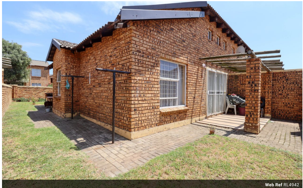
Web Ref RL4942