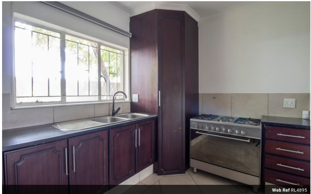
Web Ref RL4895