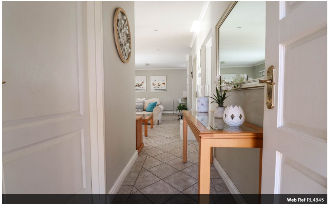
Web Ref RL4845