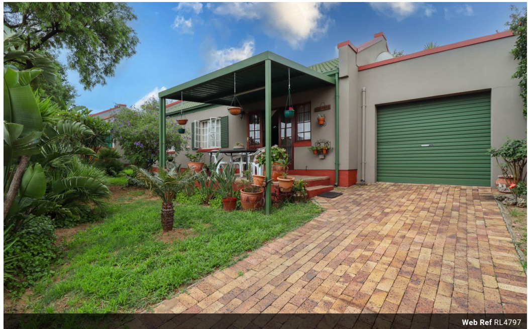
Web Ref RL4797