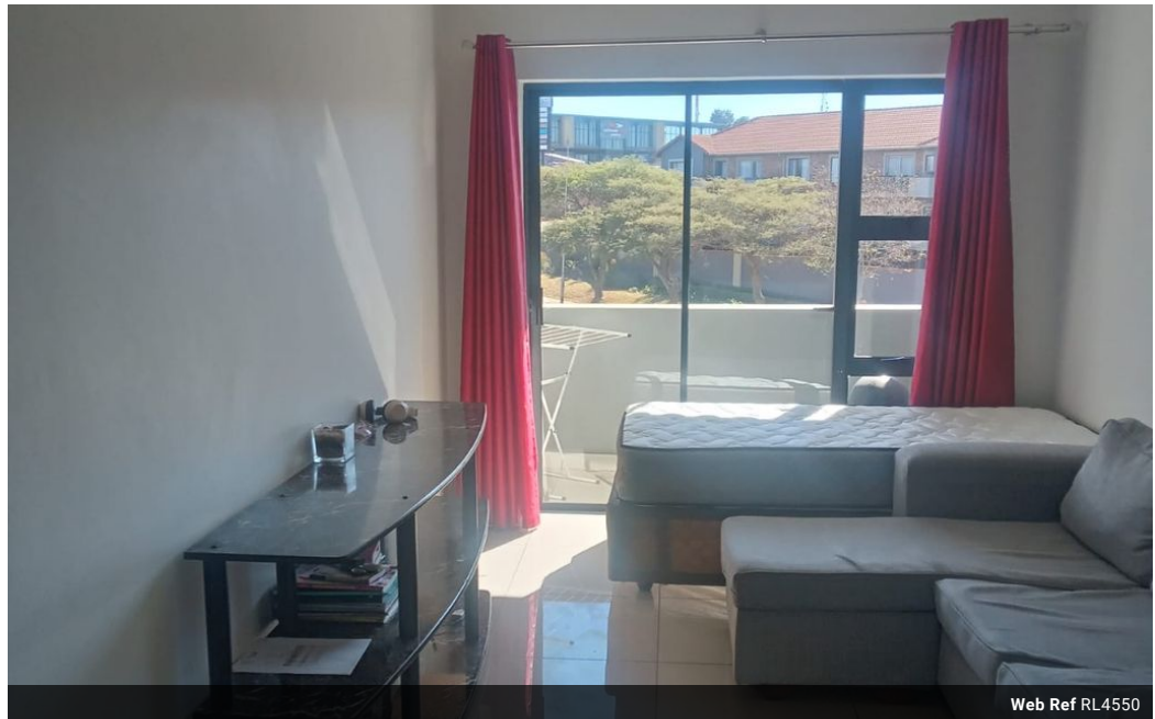
Web Ref RL4550