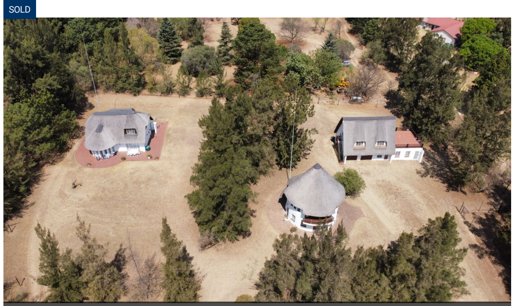
Web Ref RL4667