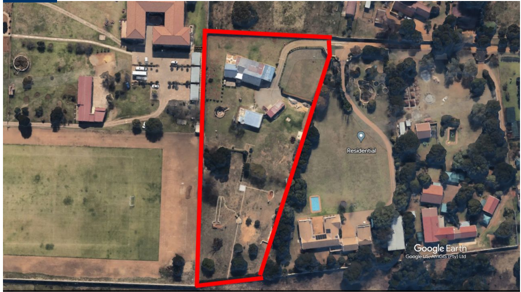
Web Ref RL4608