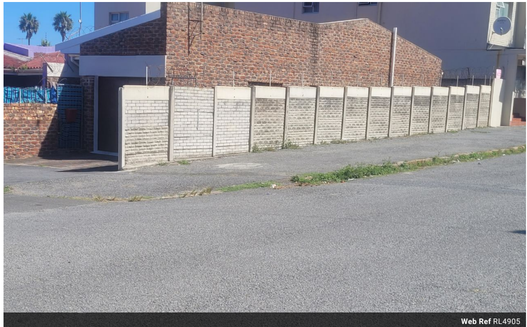
Web Ref RL4905