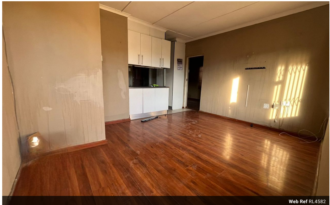
Web Ref RL4582