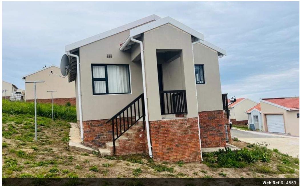
Web Ref RL4553