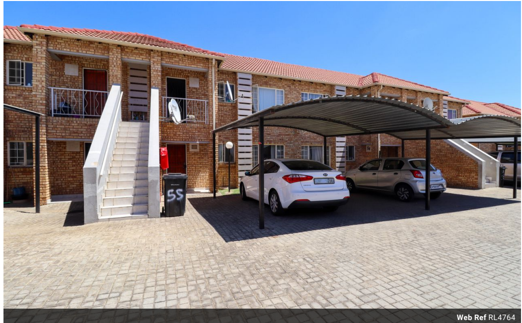
Web Ref RL4764