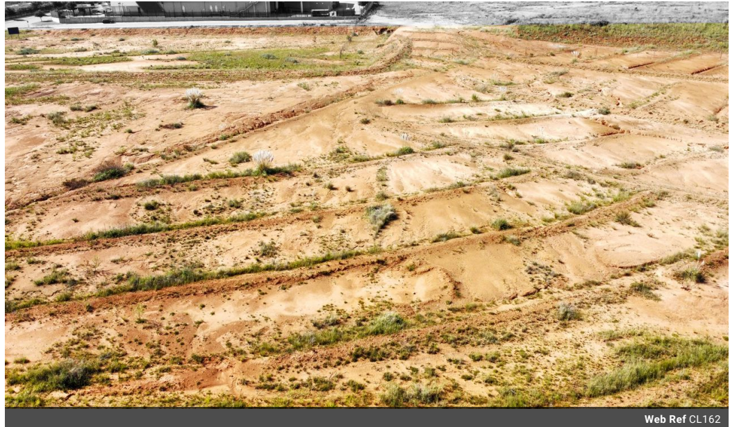
Web Ref CL162